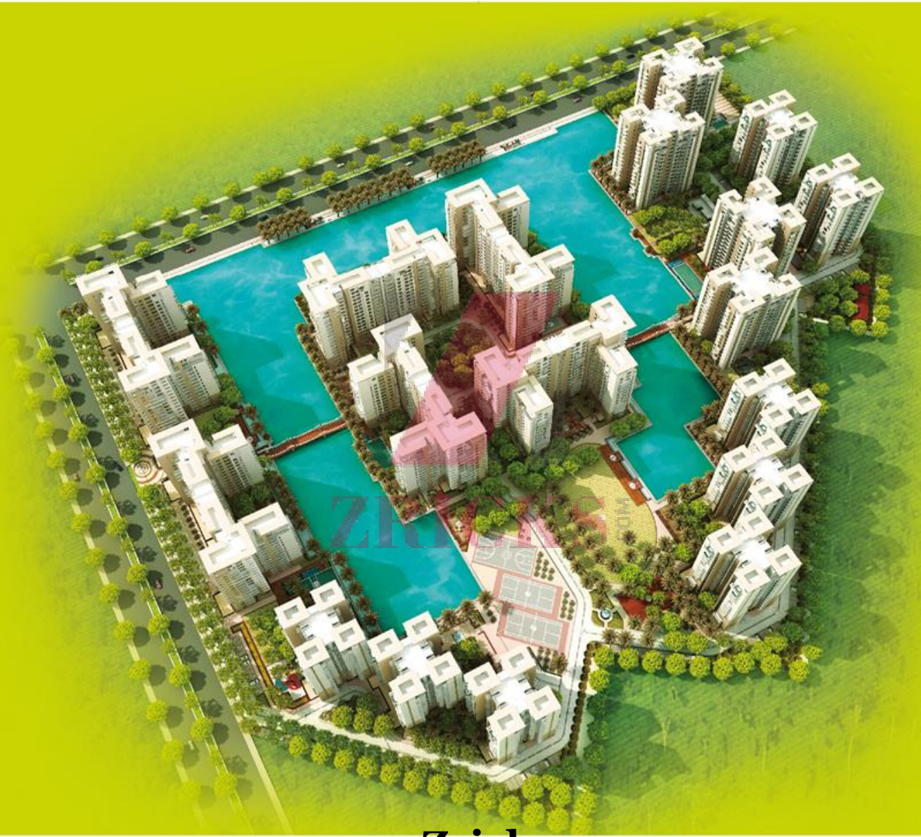
Rear Aerial View of Water Lily