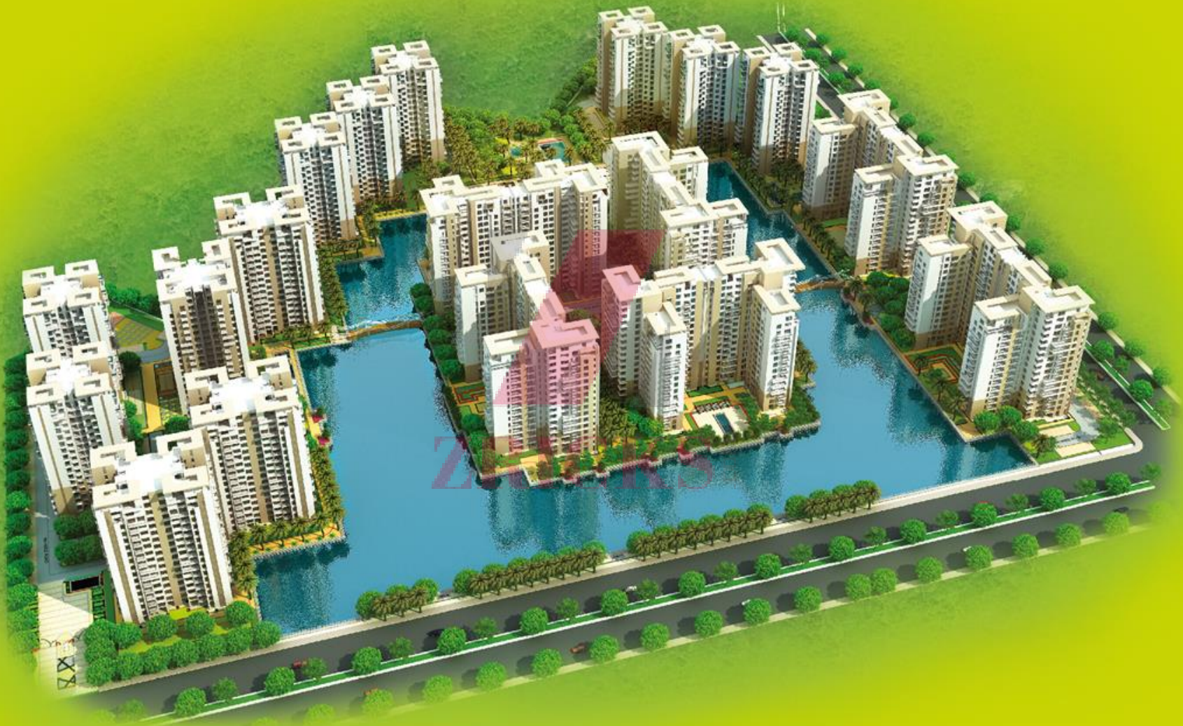
Front Aerial View of Water Lily